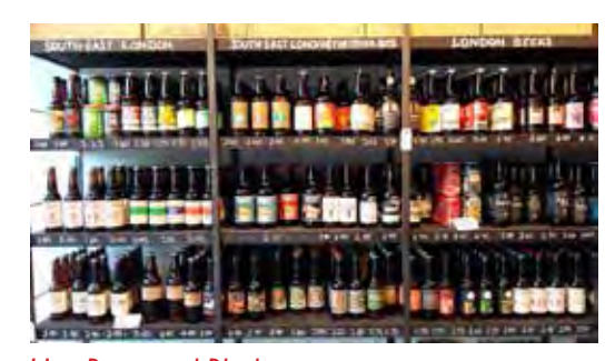
Hob Burns and Black

New Zealanders len and Glenn opened this smart beer shop/tasting room on the Peckham Rye/East Dulwich borders just before Christmas, and it's immediately become one of the best places for good beer in London. It offers a staggering range of over 250 bottled beers from around the world. How times have changed; one entire section is devoted not only to London beers, but South East London beers! The selection is wall to wall quality, and includes beers from countries as far flung as New Zealand (of course!), Denmark, Belgium and the US as well as a great selection of local favourites. Four draught lines offer flagon/growler fills to take home, and hot sauce and vinyl complete the mix. Choose any bottle and drink it on site, hence the listing in our Guide. The space is small but a recent addition is more outside seating, perfect on a good day.