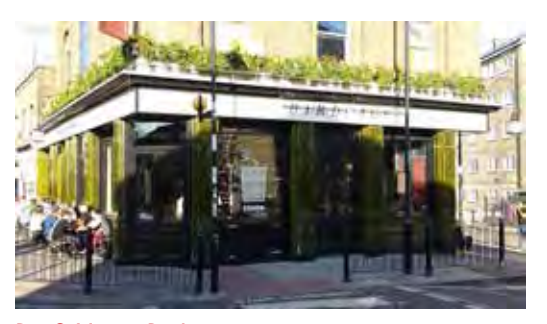
Draft House Birdcage

just happens to serve great beer - in this case 3 cask ales alongside 15 or so high quality keg offerings, and a really well chosen bottled list of around 85. The food is good too, with pies being prominent - and again very good quality.